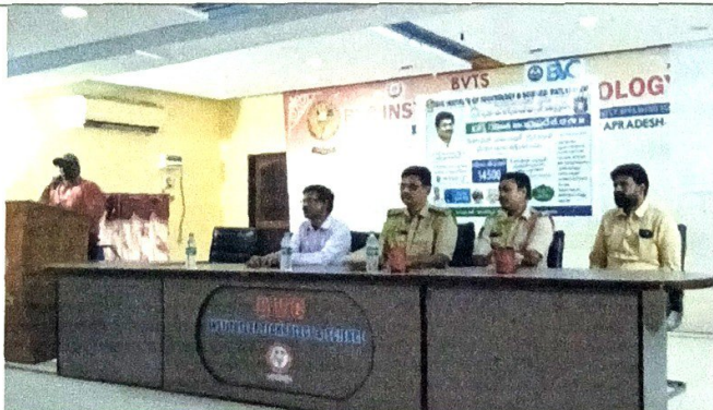
Awareness Programme on Anti-Drugs