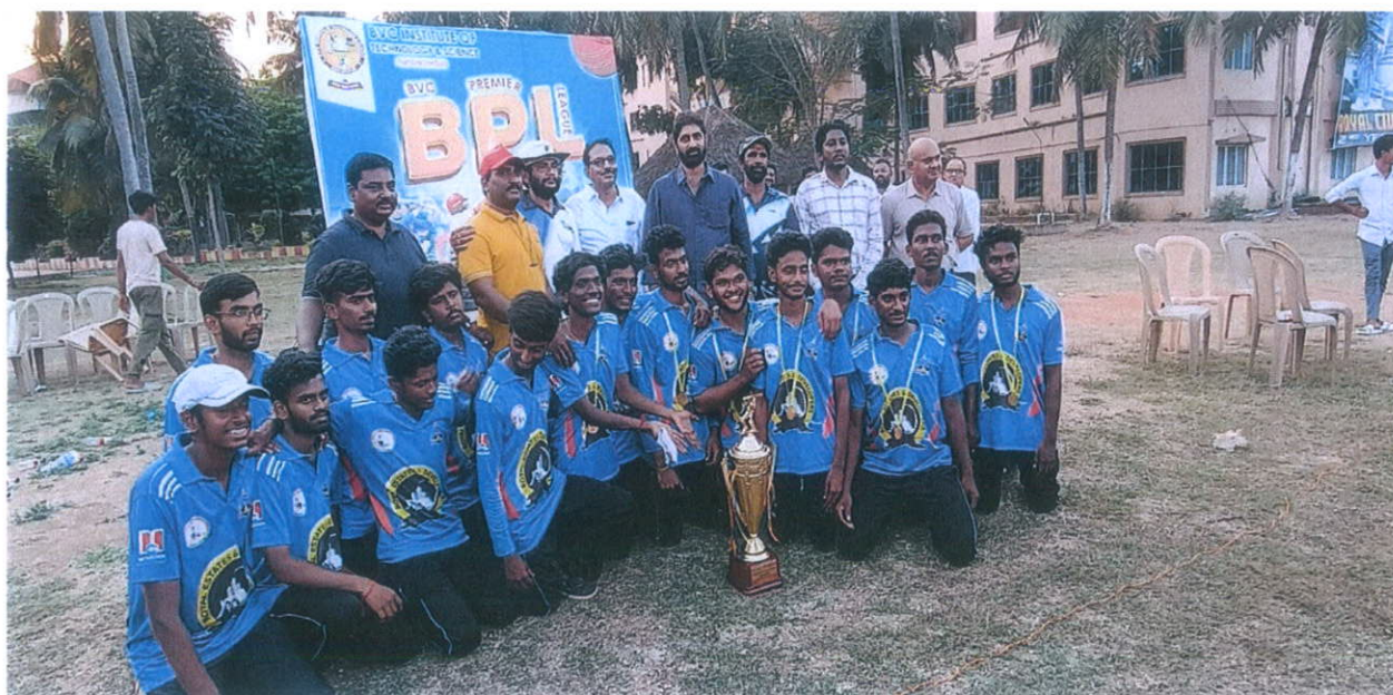
WINNERS (CAD & ML) in BPL 2025 (BVC PREMIER LEAGUE CRICKET TOURNAMENT)