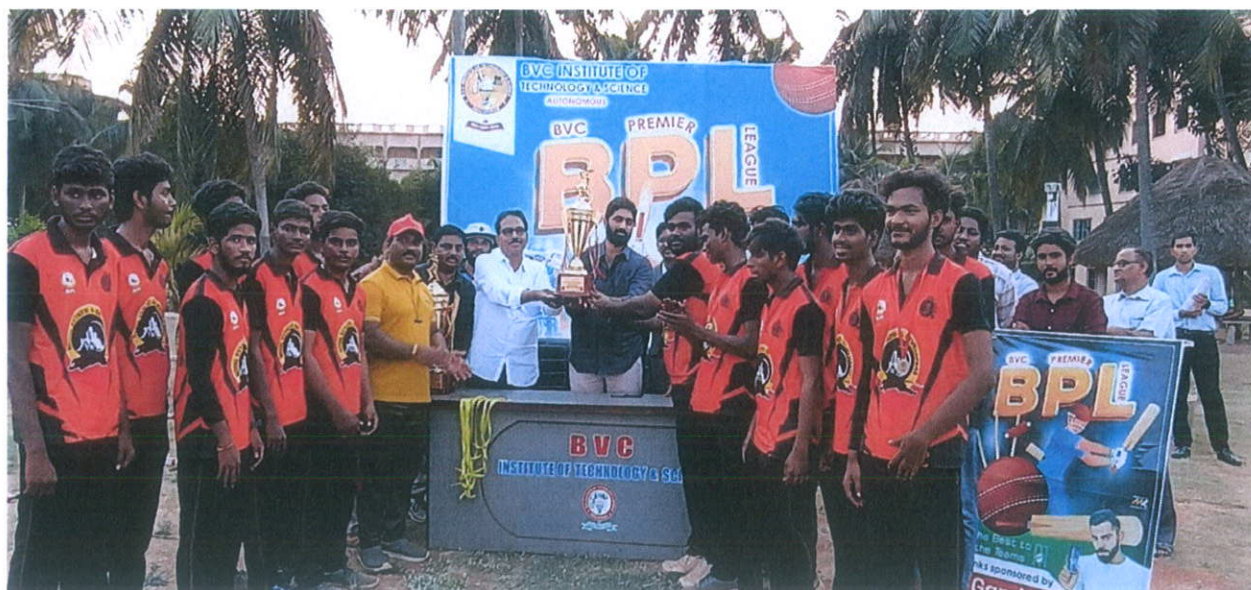
RUNNERS (Civil) in BPL 2025 (BVC PREMIER LEAGUE CRICKET TOURNAMENT)