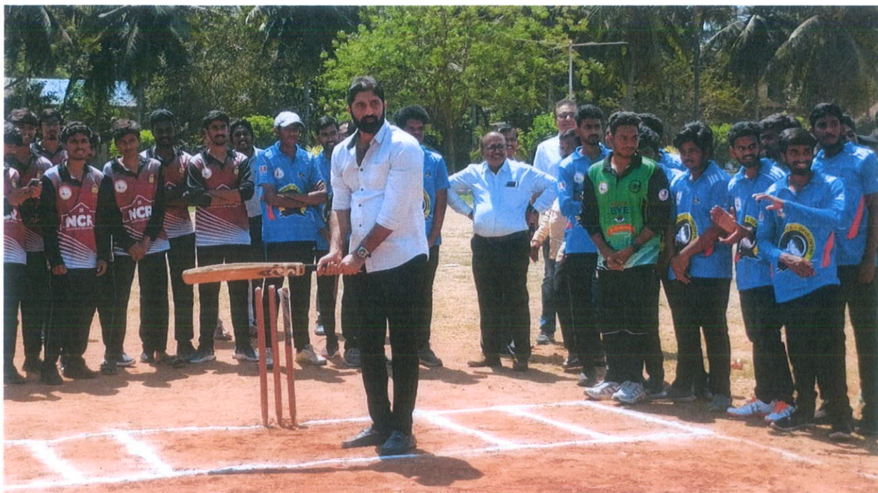
INAUGURATION PROGRAM BPL 2025 (BVC PREMIER LEAGUE CRICKET TOURNAMENT)