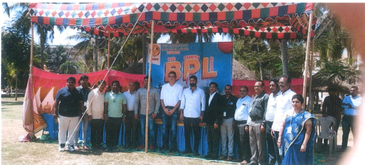
INAUGURATION PROGRAM BPL 2025 (BVC PREMIER LEAGUE CRICKET TOURNAMENT)